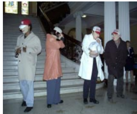
The Improbable Players at the Massachusetts Statehouse