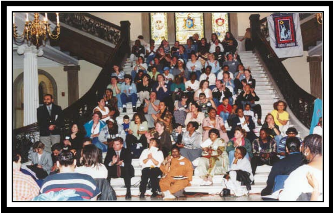
The Boston Consortium of Families in Recovery Celebration at the Massachusetts State House February, 2002, MOAR was one of the co-sponsors of this beautiful event